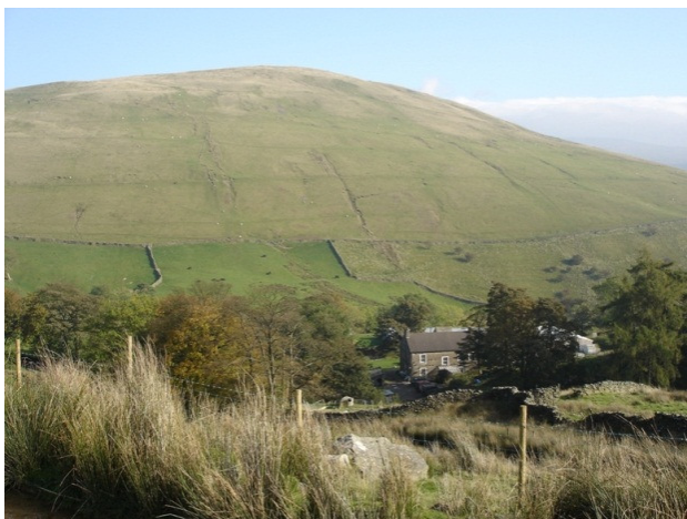
Adamthwaite Farm, and the Howgill Fells

"There are many attractively situated farmhouses in the side valleys of the Howgills, none more so than Adamthwaite, deep set amongst lovely trees and in scenery reminiscent of a Scottish glen. It is remote, unsuspected and rarely seen".